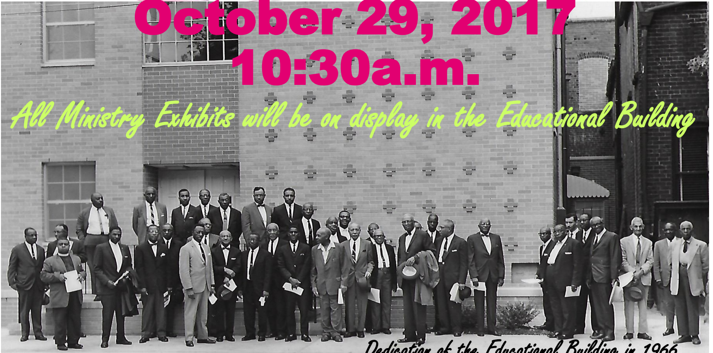
Dedication of the Educational Building in 1966

All Ministry Exhibits will be on display in the Educational Building