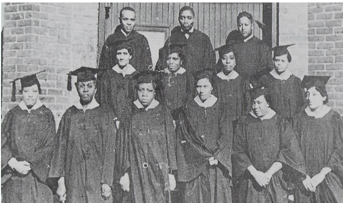
Senior Choir 1940